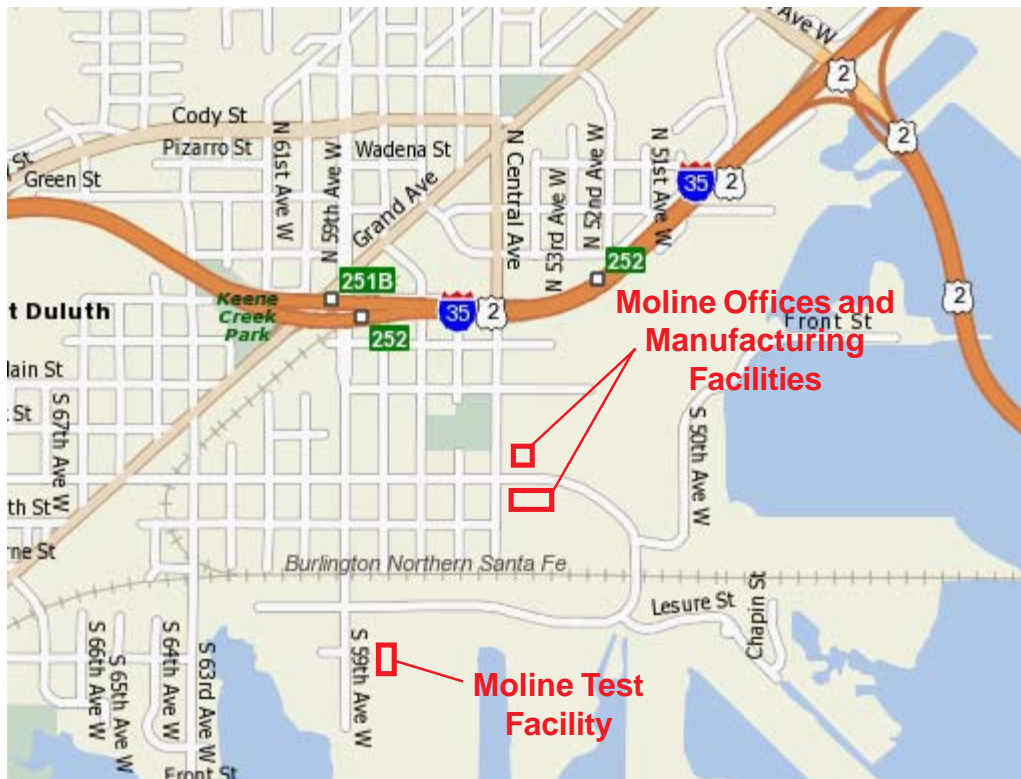
Detail of West Duluth (Moline Location)