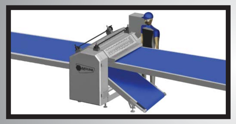
Compact, Ergonomic Sheeter Profile

The compact, ergonomic profile accommodates operator height for easy access.