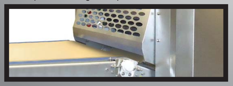
Dough Sheet Reduction

The sheeting roller opening gap settings dictate the amount of dough sheet reduction. The roller opening gaps are adjusted with hand wheels on the sheeter cabinet or with the optional automatic roller opening adjustment. The automatic version contains a drive and sensor system and is manipulated through the operator interface.