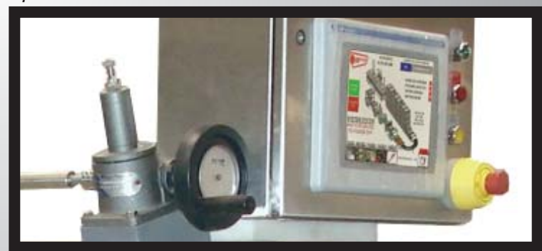
Operator Interface Panel (Models Vary)

Sheeting roller speeds are easily adjusted through the operator interface.