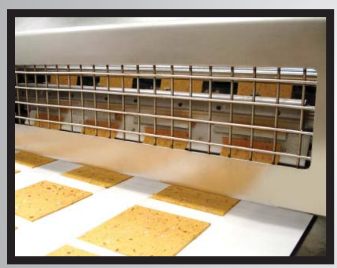
Rotary Flywheel Guillotine (discharge view)