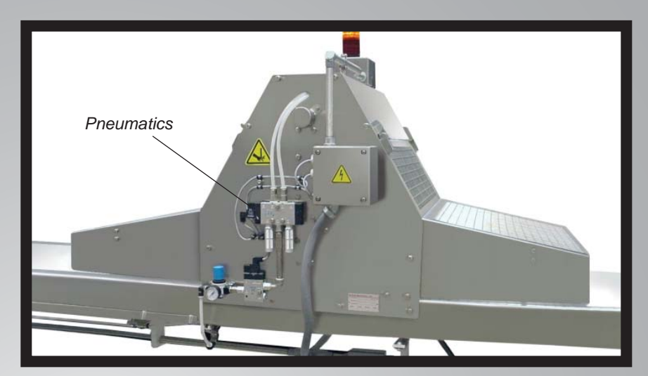
Lever Action Guillotine

Cutting blade pressure is adjusted at the pneumatic regulator.