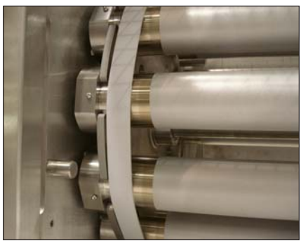
3.5" Diameter Rollers and Bearings

Large diameter multi-roll design offers rapid yet gentle dough reduction. The angle (\ominus) of attack, as dough enters the sheeting rollers, is minimized and surface contact increased compared to smaller sheeters.