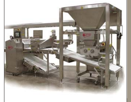
High Capacity Donut Systems