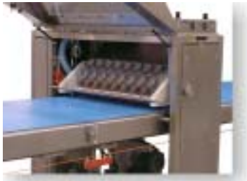
Driven Cutting Stations

Positive drive allows precise control of cutting length or product position for high speed panning operations downstream.