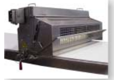
Pneumatic Cutting Stations

Moline's extensive experience manufacturing precision rotary cutters is well known in the industry. The cutting area used to manipulate these cutters on a make-up line has a direct impact on cutter performance, productivity and safety. From 24" to 60" wide lines, Moline offers the right solution.