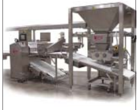
High Capacity Donut Systems