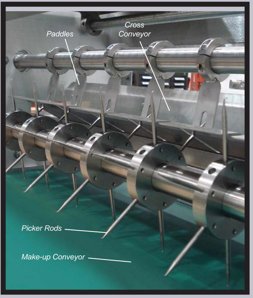
Portable Donut Hole Removal Unit (interior) (shown with guard open during shutdown)

An optional proximity sensor synchronizes the action of the donut hole removal unit with other equipment on the production system.