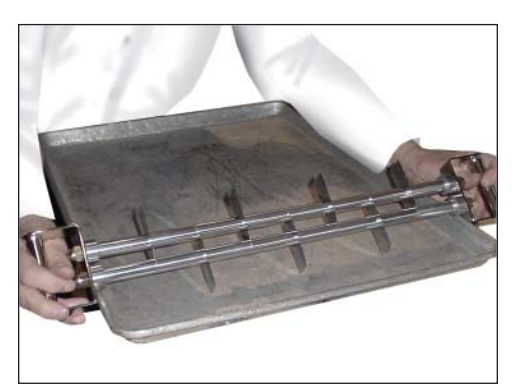
Correct Cutter Position For Cutting

With the blade tilted at an angle as shown at right, the cutters will cut nutmeats and other hard products against the bottom of the pan and will not rake the particles up through the iced surface.