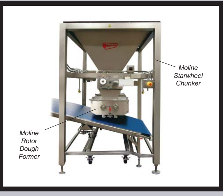
Using a Dough Former

Optional Dough Former Guides on Chunker Frame