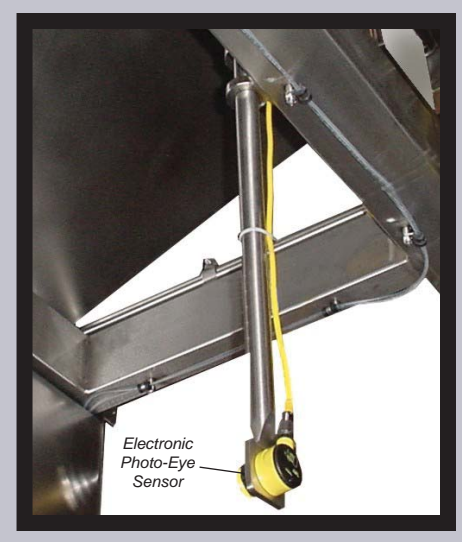
Dough Sensors on Chunker Frame

In-position switch between starwheel chunker frame and dough former frame ensure correct positioning for optimum operation.