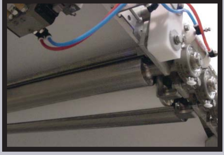
<u>Tracking Rollers Beneath Conveyor Bed</u> (shown non-operational with guards removed)