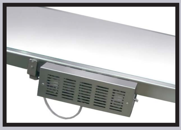
Belt Tracker With Front Guard Installed