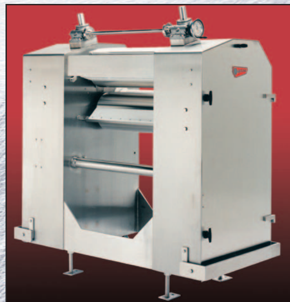
Verticle 2-roll Sheeter