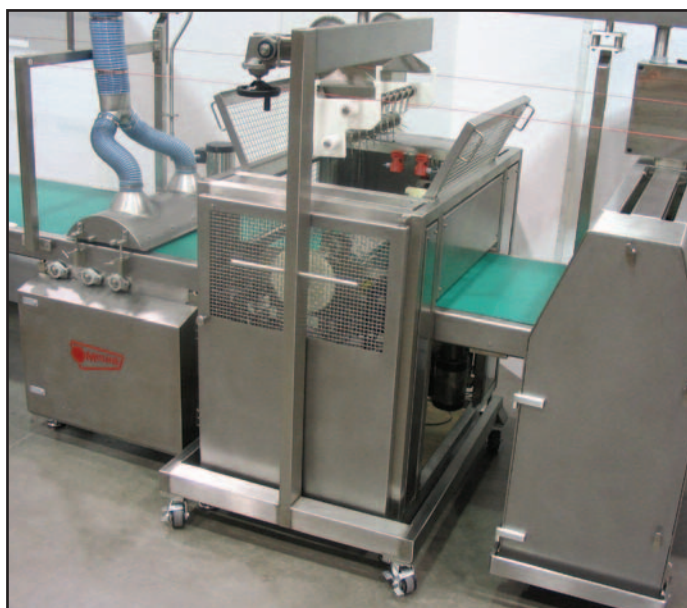
Mobile Lift Removing Make-up Accessory