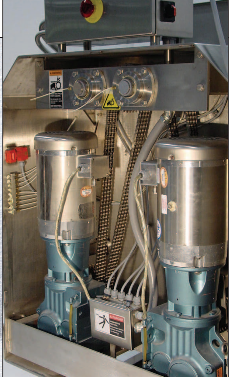
Tri-Roll Drive Compartment

For more details on low-carb production or Moline Sheeters, call 1-800-767-5734.