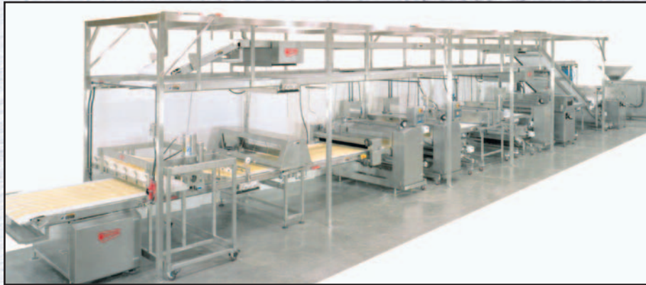
High-capacity Sheeting Line