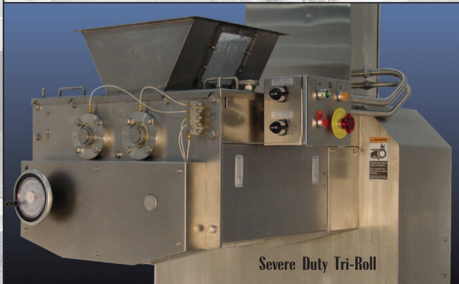
Severe Duty Tri-Roll