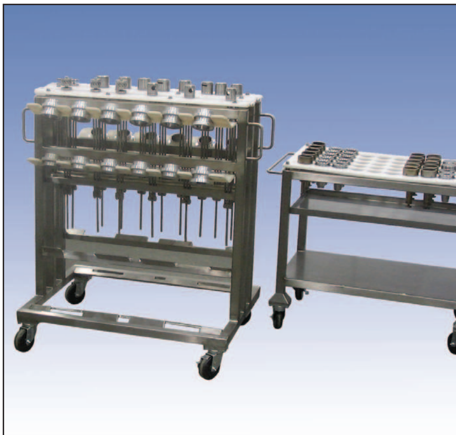
Cake Cutter Storage

Protect your investments in equipment and labor with handling and storage pieces from Moline. For more information on accessory handling and storage, contact Moline's Customer Service department at 1-800-767-5734.