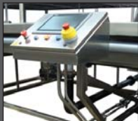
Pedestal Mounted Style