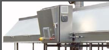
Canopy Mounted Style

Several control panel styles are available, each with an easy-to-use touch screen that includes electronic control buttons and graphs for monitoring processes. Panel locations can be pedestal-mounted, canopy-mounted or remote-mounted.