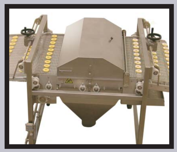
Removing Flour From Product With the Flour Removal Conveyor

Includes a filter/regulator and control valves necessary to activate the air knives when compressed air is used: 10 cfm @ 100 psi (5 liters/sec. @ 7 bar).