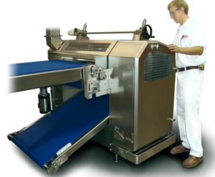
LIBRA 1I-32R Sheeter (Single)