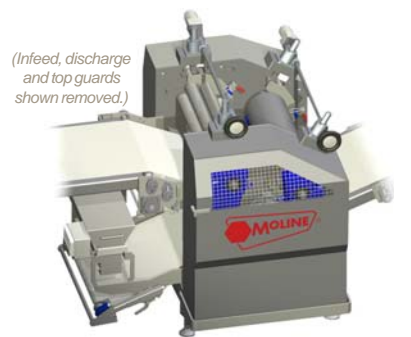
LIBRA 2I-32R Sheeter (Dual, With Satellite Roller)

Low Profile Design/Multiple Configurations