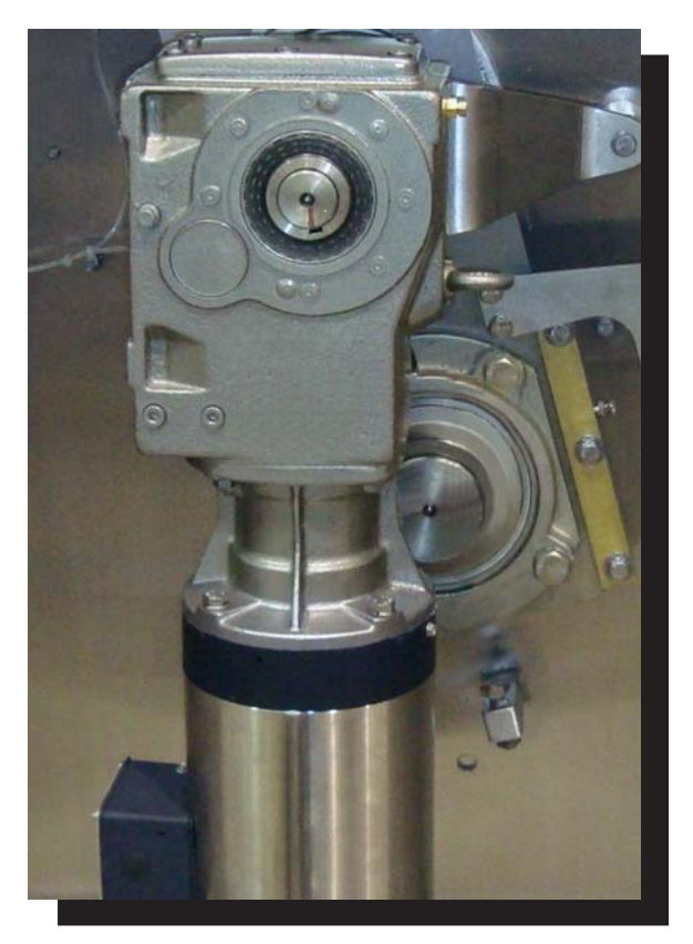
Oversized Gearbox Drives and Piloted Bearings