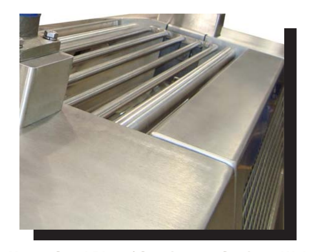
Heavy Steel Plate / Continuous Sanitary Welds