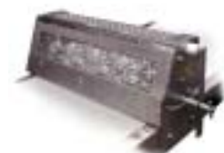
Manual Quick Adjust

Easily adjusts for different cutting widths and lanes. Unique counter-weighted design controls cutting force.