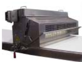
Pneumatic Cutting Stations

Moline's extensive experience manufacturing precision rotary cutters is well known in the industry. The cutting area used to manipulate these cutters on a make-up line has a direct impact on cutter performance, productivity and safety. From 24" to 60" wide lines, Moline offers the right solution.