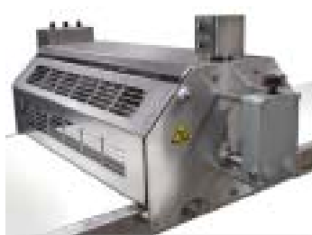
Dual Cutting Stations