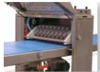
Driven Cutting Stations