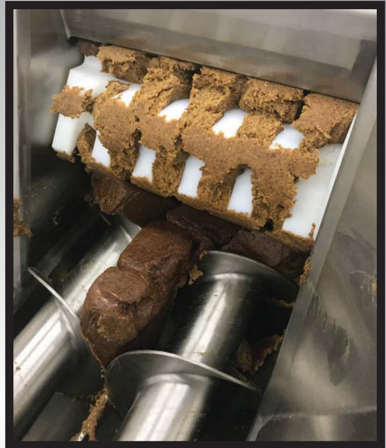
Augers and RAMroller Processing Product

Easily disassembled in minutes without tools, including the roller and auger. The transition disconnects quickly with retaining clamps and swings away on the pump frame assembly which provides complete accessibility for cleaning and preventive maintenance.