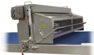
Pneumatic Cutting Stations