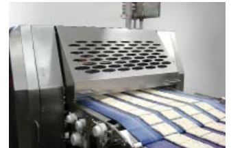
Stampers and Dies