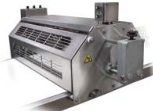
Tandem Rotary Cutting Stations