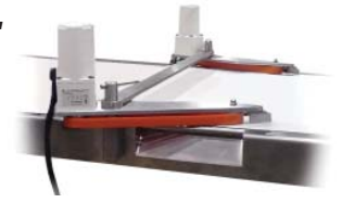
Powered Scrap Diverters