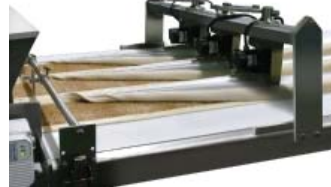
Tapered Curling Rolls