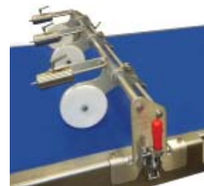
Counterweighted Impression Discs