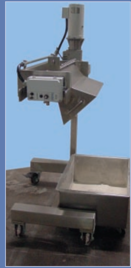
Quick Dump Flour Duster