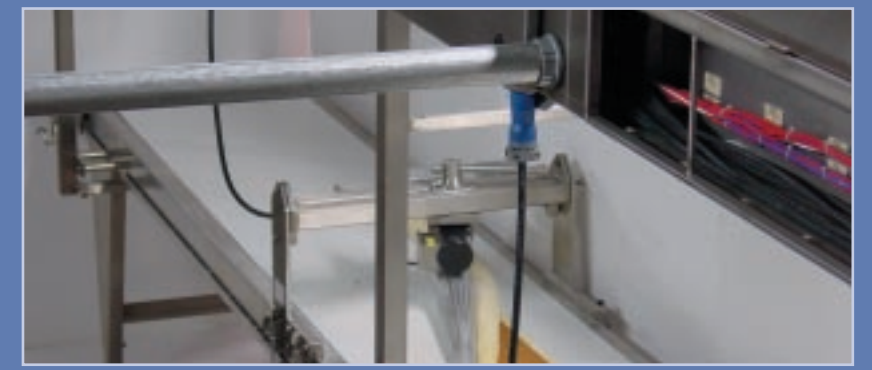
Overhead Wiring Trough