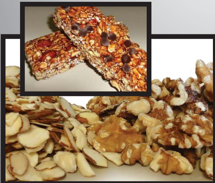
Chopped Nut Toppings

Contact us for more information: sales@moline.com