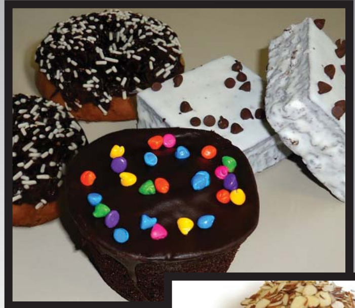
Nuts, Chocolate Chips, Candy Toppings