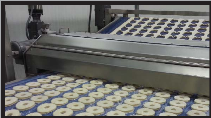
Self Threader During Production