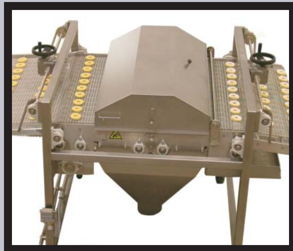
Removing Flour From Product With the Flour Removal Conveyor

Includes a filter/regulator and control valves necessary to activate the air knives when compressed air is used: 10 cfm @ 100 psi (5 liters/sec. @ 7 bar).