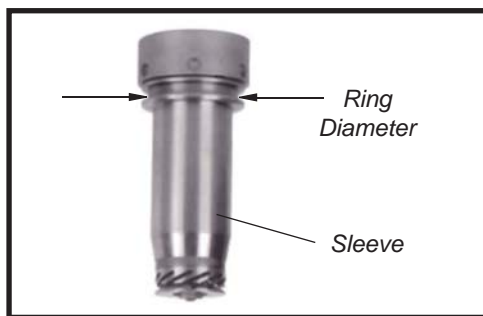
Ring Diameter on Cutter Sleeve

Plain donuts and old fashioned donuts (old fashioned