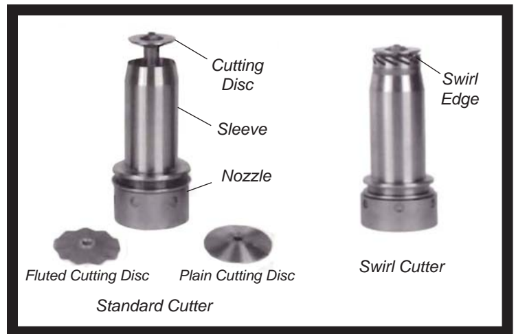
Cutters and Components

Swirl-shaped cake donuts can be extruded with standard or conversion cutters. They are available in three sizes: 1-3/8", 1-1/2" and 1-5/8" diameter.