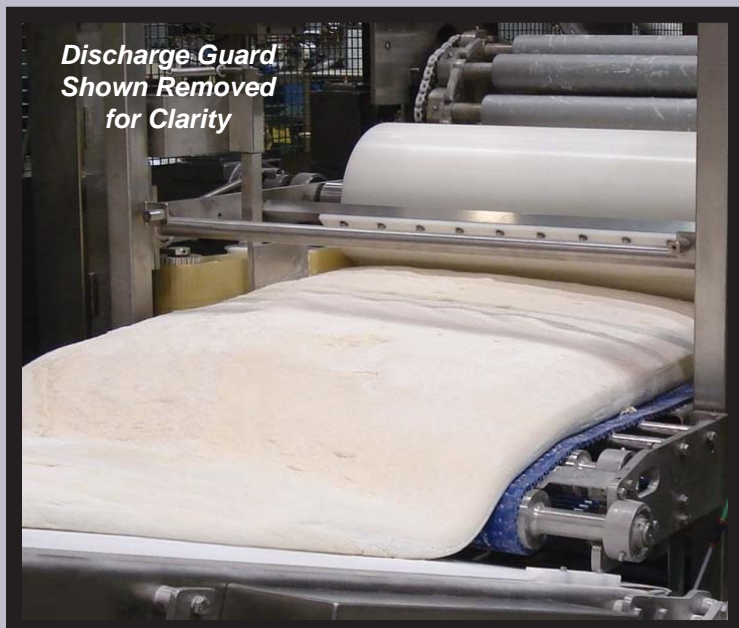
Dough Sheet Exiting the YOGA