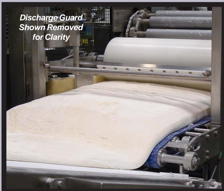
Dough Sheet Exiting the Yoga