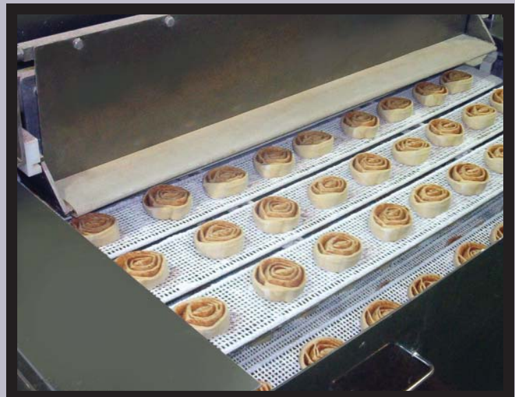
Cinnamon Rolls Loaded on Proofer Trays