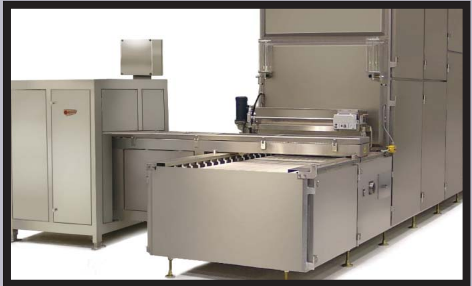
Transpositor Installed at Proofer Infeed Section

480 Volt / 60 Hertz / 3 Phase (other options are available).