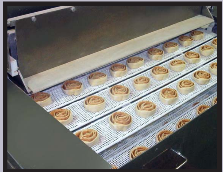
Cinnamon Rolls Loaded on Proofer Trays