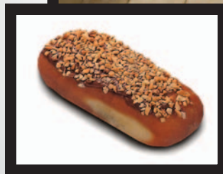
Stamping Die for Long Johns in Operation