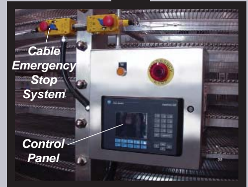
Cable Emergency Stop System