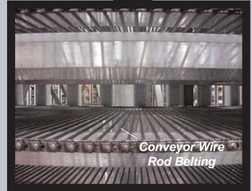
Conveyor Wire Rod Belting