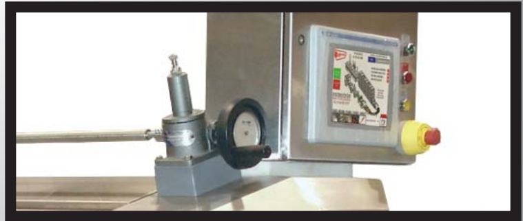
Operator Interface Panel (Models Vary)

Sheeting roller speeds are easily adjusted through the operator interface.