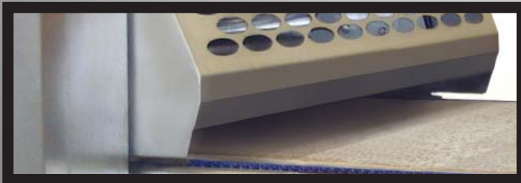
Dough Sheet Reduction

The sheeting roller opening gap setting dictates the amount of dough sheet reduction. The roller opening gap is adjusted with a hand wheel on the sheeter cabinet or with the optional automatic roller opening adjustment. The automatic version contains a drive and sensor system and is manipulated through the operator interface.