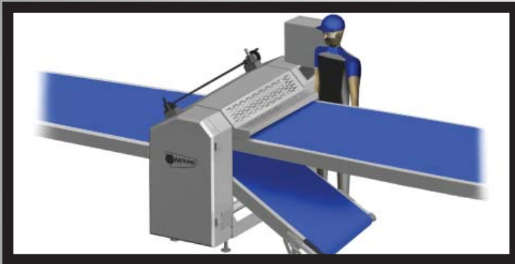
Compact, Ergonomic Sheeter Profile

The compact, ergonomic profile accommodates operator height for easy access.