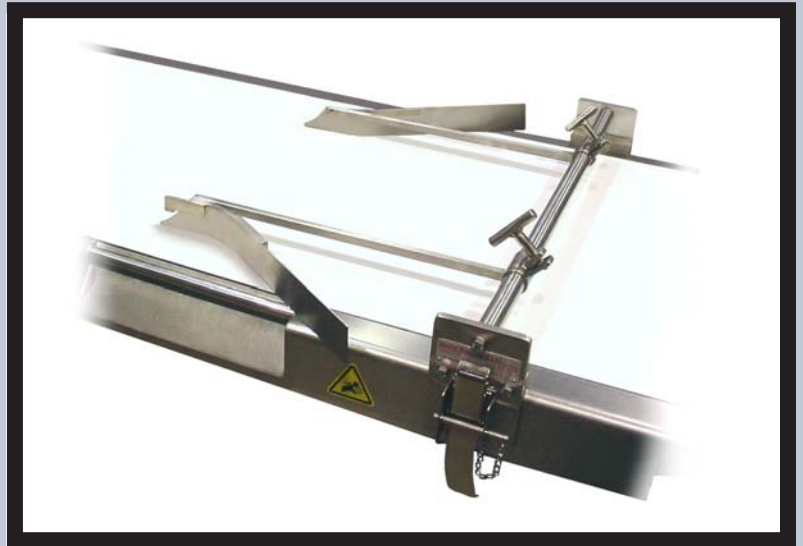
Trim Removal Unit

The trim removal unit is a non-powered piece of equipment that contains diverter blades to remove the dough that has been trimmed from the sides of the dough sheet. The diverter blades can be positioned where desired across the width of the conveyor and can be raised off the conveyor when not in use. Stainless steel construction provides excellent dough release and efficient sanitation. The conveyor rail latches allow the unit to be easily removed from the production system.