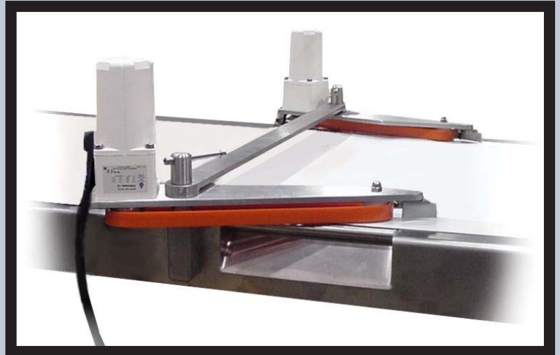
Powered Trim Removal Unit

Electrical Specifications: Standard 115 Volt / 60 Hertz / 1 Phase. Other options are available.