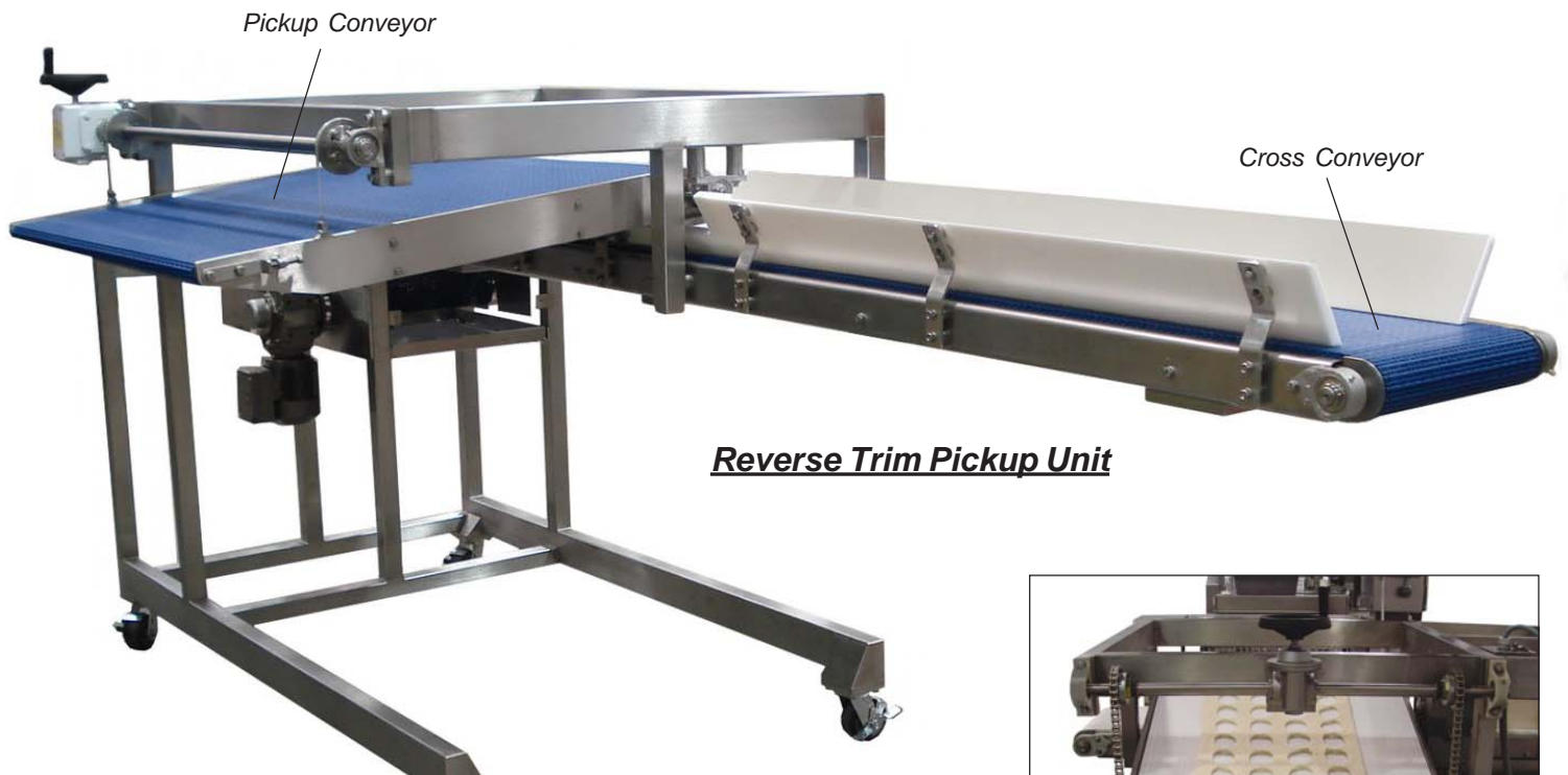
Reverse Trim Pickup Unit

The trim pickup unit (shown below) lifts the trim dough web from the makeup conveyor and transfers it to the cross conveyor where it is removed from the line for reuse. Each conveyor is independently driven by a drive motor and gear reducer. The pickup conveyor height is easily adjusted with a hand wheel. The unit is controlled through the production system's operator interface. Electrical specifications vary depending on customer requirement.