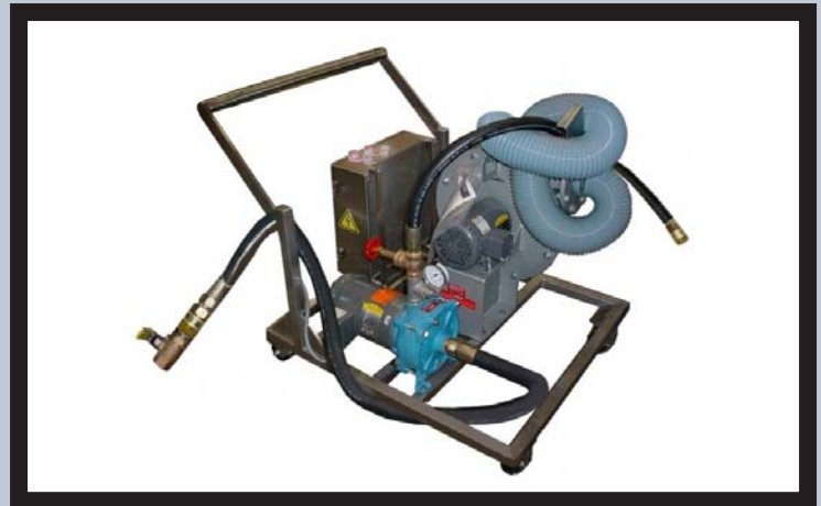
Optional Clean-In-Place Unit