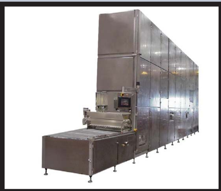
DT10-10R Proofer Without Pass-Thru Module