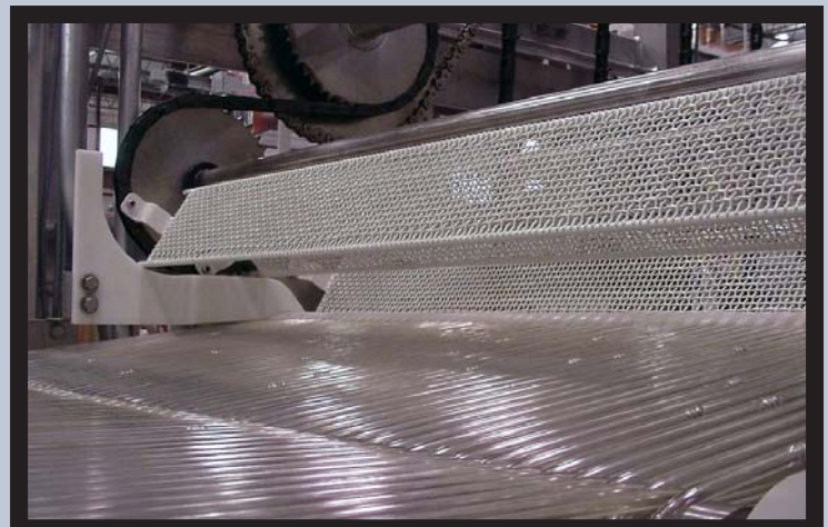
Soft Dump Discharge Mechanism