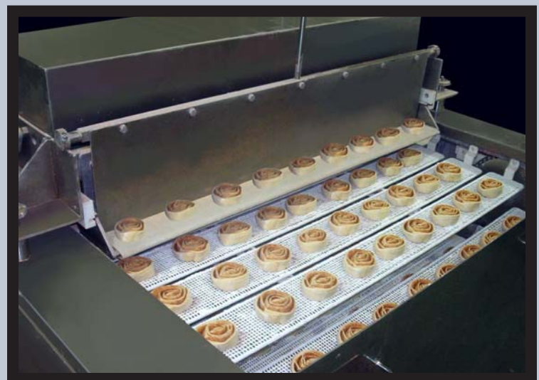
Shuttle Delivering Product to Proofer Trays