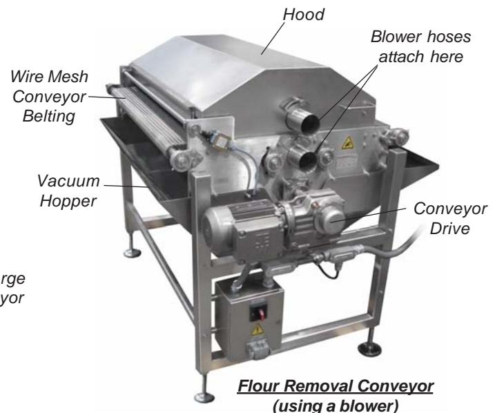
Flour Removal Conveyor (using a blower)