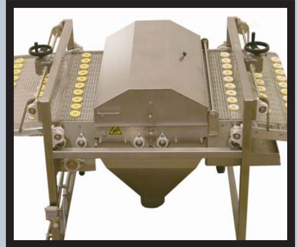
Removing Flour From Product With the Flour Removal Conveyor

Includes a filter/regulator and control valves necessary to activate the air knives when compressed air is used: 10 cfm @ 100 psi (5 liters/sec. @ 7 bar).