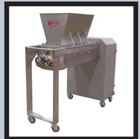
H-Frame Tri-Roll Extruder