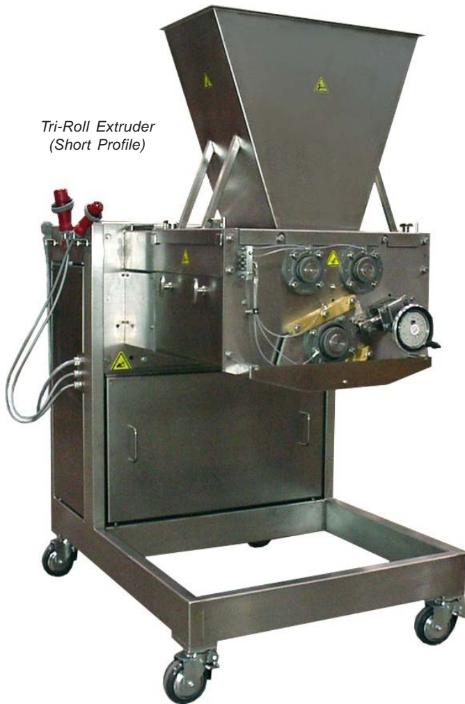
Tri-Roll Extruder (Short Profile)

The tri-roll extruder can be designed to integrate with other Moline equipment such as the starwheel chunker and sheeting systems.