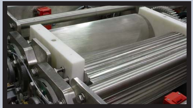
Upper Rollers Beneath Hopper