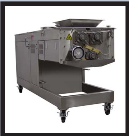
Long Profile Tri-Roll Extruder

The H-frame tri-roll extruder provides fast and efficient dough extrusion for very wide lines with a portable and stable design. The unit contains vertical roller drives and chain/gear-driven rollers.