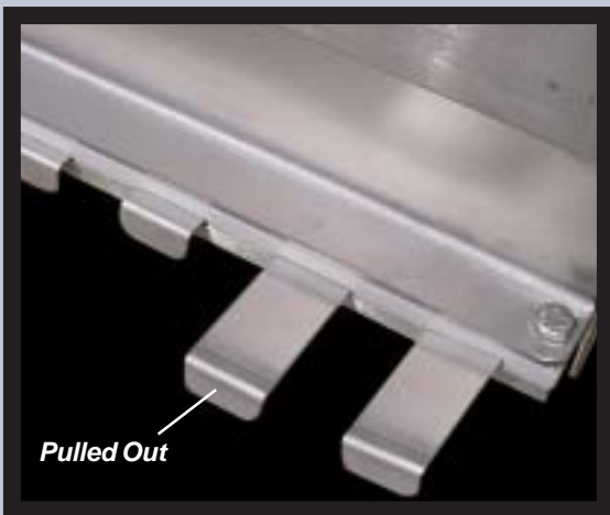
Flow Adjustment Slides

DC: 115/60/1 (90 volt DC) and 230/60/1 (180 volt DC).