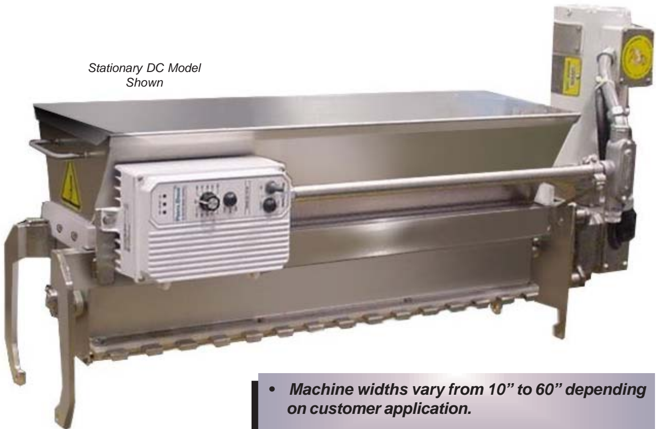
Stationary DC Model Shown

The amount of flour dispensed and the width of the dispensing pattern are adjustable. A variable speed direct drive controls the dispersion rate, while flow adjustment slides in the bottom of the hopper control the dispensing pattern.