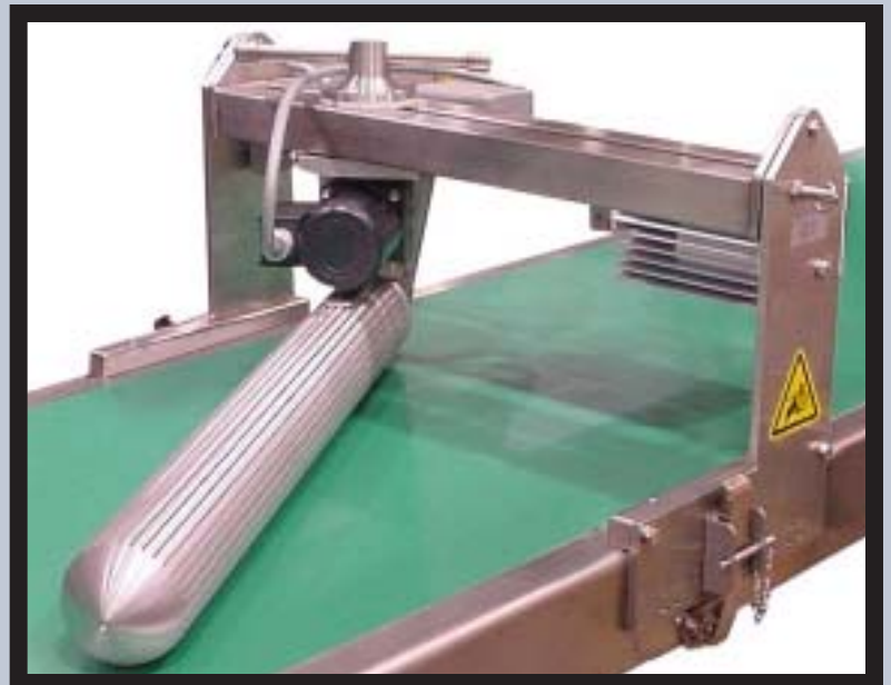
Straight Curling Roll

The straight curling roll (shown below) is nearly identical to the tapered style but contains a straight roller rather than the tapered style.