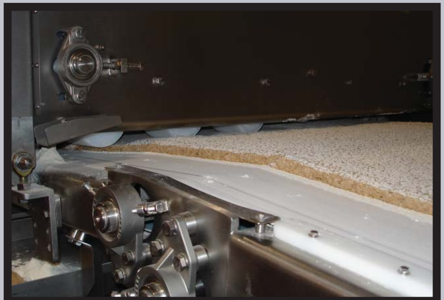
Cross Sheeting the Dough to Specific Width and Thickness