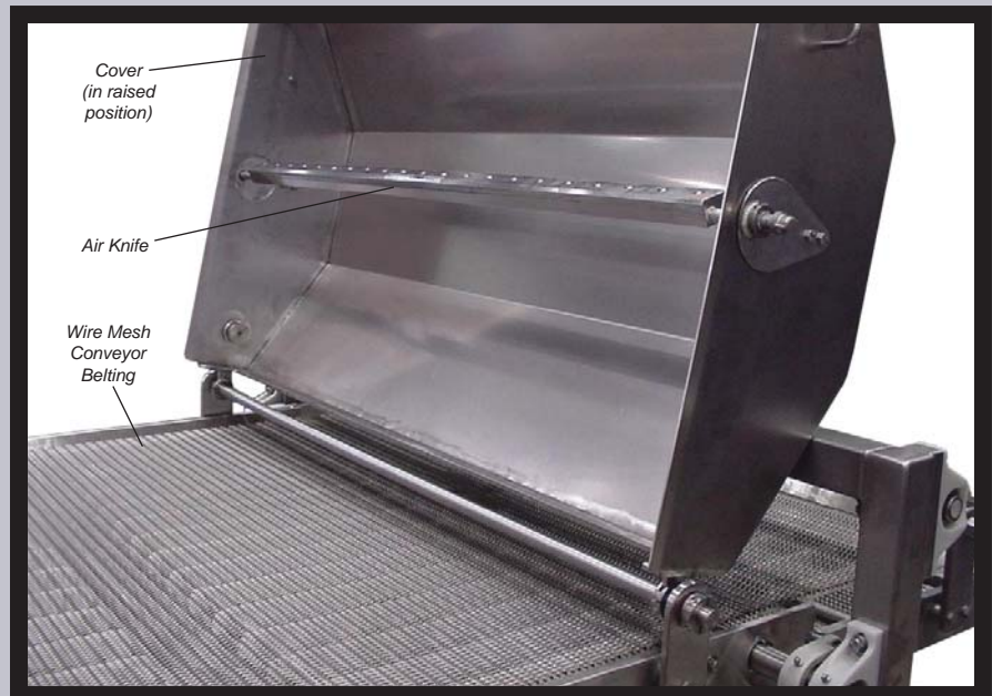
Transfer Conveyor With Cover Open