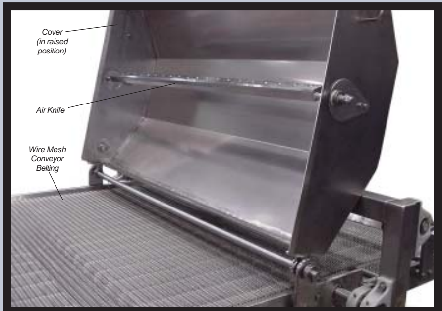
Transfer Conveyor With Cover Open