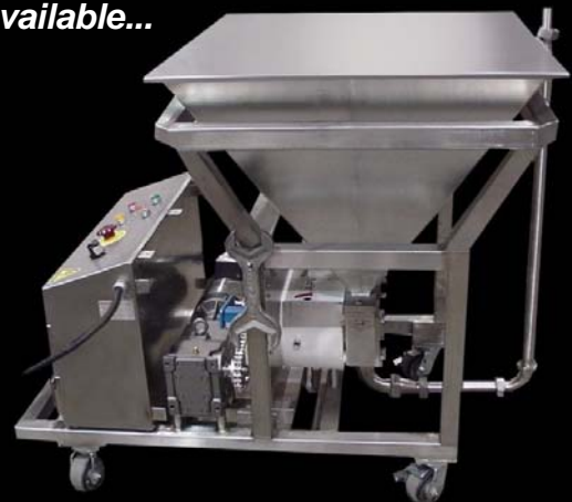
Typical Moline Filling Pump